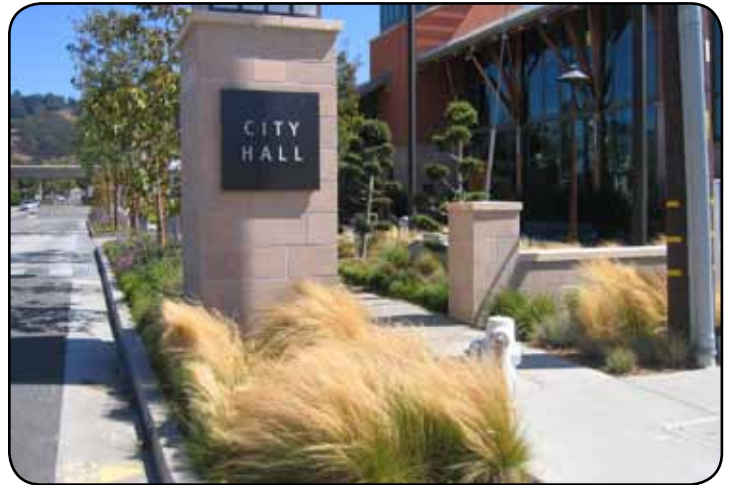
El Cerrito's City Hall drought tolerant landscaping

26,120,000 gallons used in 2001 18,684,000 gallons used in 2008 29% reduction in water use $7,000 savings per year for water and energy