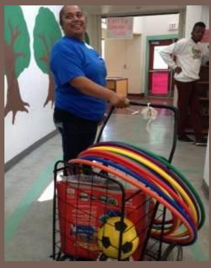
BUILDING HEALTH, ENVIRONMENT & EQUITY INTO ALL POLICIES